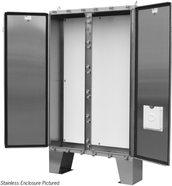
Stainless Enclosure Pictured

Construction: C & I Enclosures Type 4 Painted Floor Mounted Double Door Enclosures are fabricated in accordance with U.L. specifications from code gauge material. A rolled lip is provided around three sides of each door and along the top of the enclosure opening to exclude liquids and contaminants. An oil resistant gasket is attached to the doors. The enclosures are provided with continuous hinges and door clamps on three sides of each door to insure a water-tight seal. A hasp and staple are provided on each door for padlocking. These enclosures have a removable centerpost for easy access to the enclosure. Each enclosure is provided with lifting eyes for easy handling. All seams are continuously welded and ground smooth. Collar studs are provided for mounting panels.